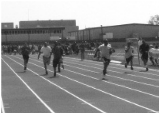
Juveniles competing in statewide Juvenile Olympics.

Juvenile Probation Services was recently awarded a federal grant to integrate a risk and needs assessment instrument with our case processing system. This research-validated instrument will allow probation officers to identify a client's needs, select local services, and track perform-