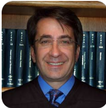
Patrick De Almeida Presiding Judge of the Tax Court

The Tax Court of New Jersey is a statewide trial court that resolves disputes between taxpayers and local and state taxing agencies. Tax Court judges hear appeals directly from decisions of local tax assessors and the decisions of county boards of taxation, which hear property tax disputes involving taxpayers and municipalities.