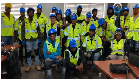
APEX Solutions Group LLC, Train to Hire Program