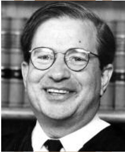
Judge Joseph C. Small Presiding Judge of the Tax Court

The Tax Court resolves disputes between taxpayers and local and state taxing agencies. Created in 1979, the Tax Court reviews determinations of tax assessors, county boards of taxation, and state agencies to make decisions on whether a tax has been assessed fairly. On occasion, a judge of the Tax Court may hear Superior Court cases that involves complex tax issues.