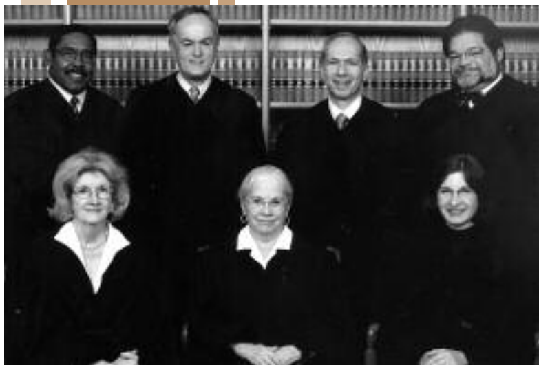
New Jersey Supreme Court

As the state's highest appellate court, the New Jersey Supreme Court decides appeals from the lower courts, including capital cases and cases in which a panel of appellate judges has disagreed on one or more issues on appeal. In addition, litigants may file a petition for certification with the Court to request that they hear their appeal. The Court may agree to hear an appeal because it presents legal issues of great importance to the public or because the issue is the subject of separate, conflicting appellate opinions. In deciding the cases that come before it, the Court interprets the New Jersey and the United States Constitution, New Jersey statutes, administrative regulations of the state's governmental agencies, as well as the body of common law.