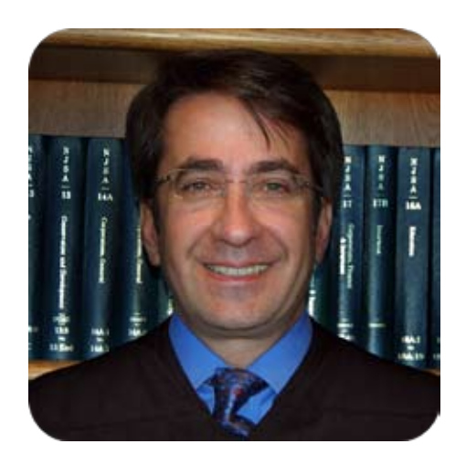
Patrick De Almeida Presiding Judge of the Tax Court

The Tax Court of New Jersey is a statewide trial court that resolves disputes between taxpayers and local and state taxing agencies. Tax Court judges hear appeals directly from decisions of local tax assessors and the decisions of county boards of taxation, which hear property tax disputes involving taxpayers and municipalities.