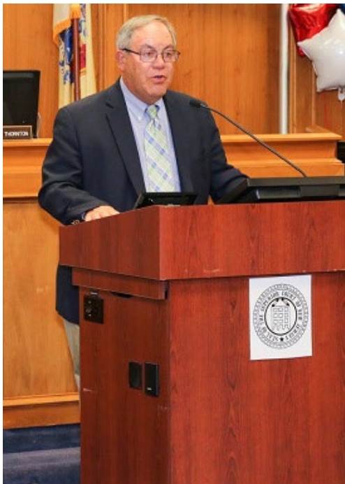
General Ceremony Photos: