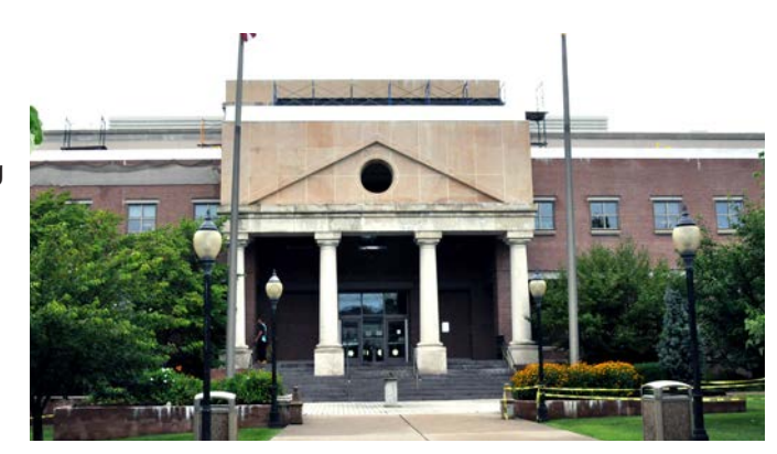
The Hunterdon County Justice Center in Flemington as it appears today.

The courthouse remained in use until 1996, when the current Hunterdon County Justice Center opened. The historic courthouse was rededicated on Oct. 16, 2000 following restoration of the exterior that included repair of deteriorated stucco and masonry, roof and window restoration and site drainage improvements. Artifacts from the courthouse remain on display, including the witness chair from the Lindbergh trial and hand-carved jury chairs.