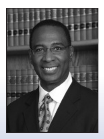
A Letter from ACTING ADMINISTRATIVE DIRECTOR