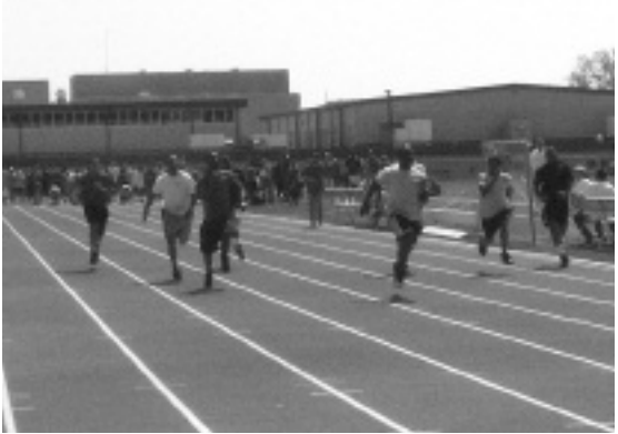
Juveniles competing in statewide Juvenile Olympics.

Juvenile Probation Services was recently awarded a federal grant to integrate a risk and needs assessment instrument with our case processing system. This research-validated instrument will allow probation officers to identify a client's needs, select local services, and track perform-