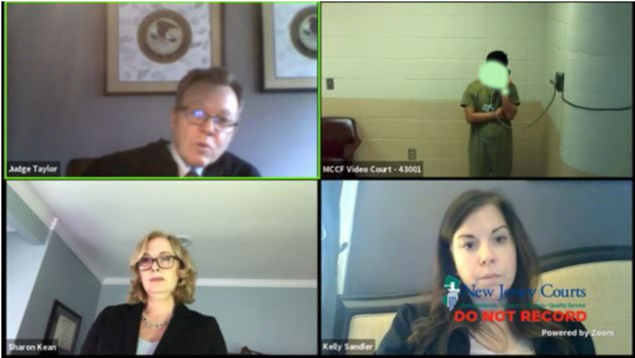
Superior Court Judge Stephen Taylor presides over a motion to reopen detention in Morris County on April 13, 2020.